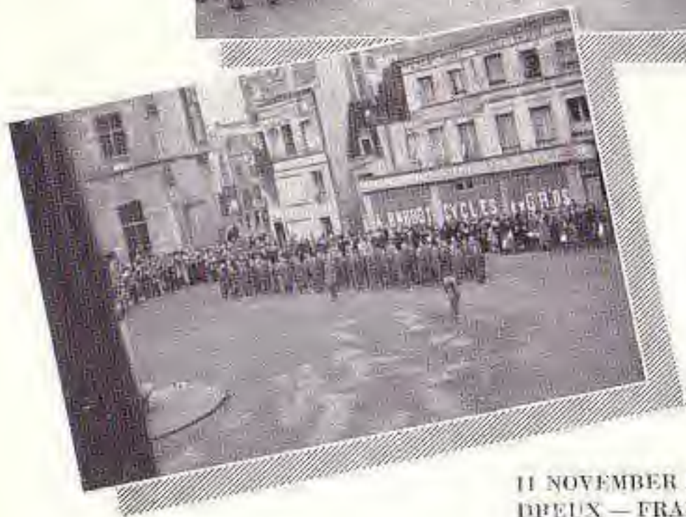
11 NOVEMBER 1944 DREUX — FRANCE